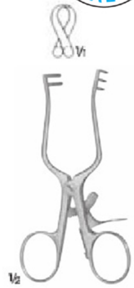
WEITLANER EM-24-3388 Sharp 11 cm