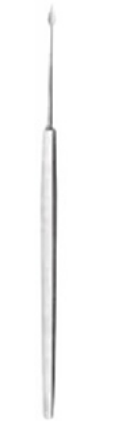
EM-24-3385 Microscopic needle with metal handle 13 cm