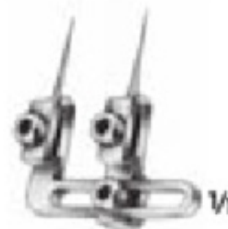
BIEMER EM-24-3391 Approximator, complete with key EM-24-3390