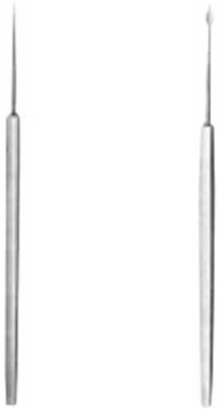
EM-24-3384 Microscopic needle, with metal handle 13 cm