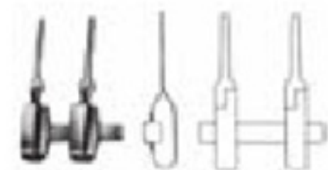
BIEMER-MÜLLER EM-24-3394 Length of jaws 9 mm Opening 5 mm Closing force 25-30 gr.