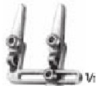
BIEMER EM-24-3392 Approximator, complete with key EM-24-3390

For micro vessel anastomosis Safe and careful gripping of vessel. Blades with serrated blade surface The ability to manually set the pressure Distance, zoom in and out manually