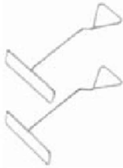
MULLER EM-24-3386 Retractors for mouse pairs