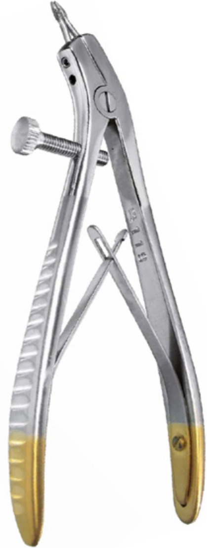
EM-4947-51 Ø 1,6 mm 12,5 cm Diamond tips