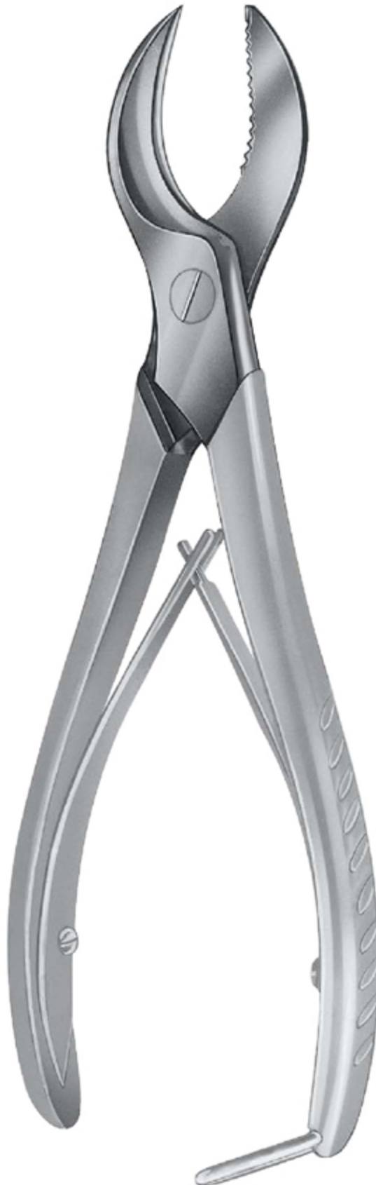
EM-4558 20,0 cm Plaster cutting pliers