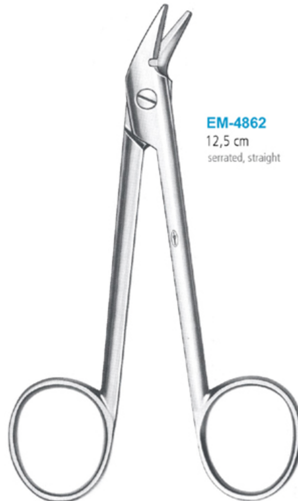
EM-4862 12,5 cm serrated, straight