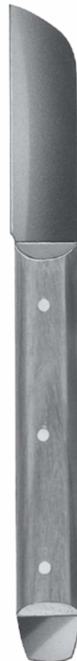
EM-4542 GRITMAN 16,0 cm Plaster knife