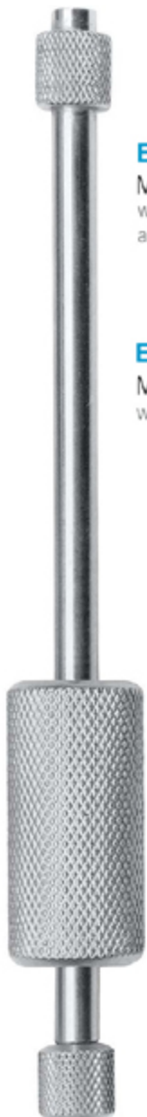
EM-4924-10 MORELL with tips 4924-1, 4924-2 and 4924-3