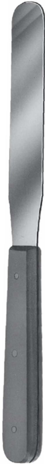
EM-4560 19,0 cm Spatula for impression materials very flexible