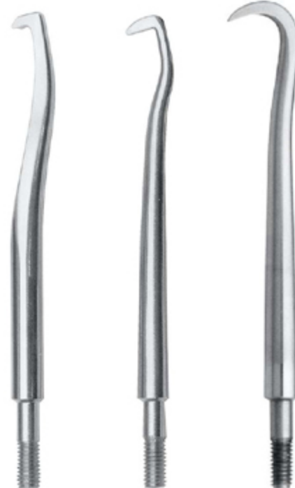
EM-4924-1 EM-4924-2 EM-4924-3