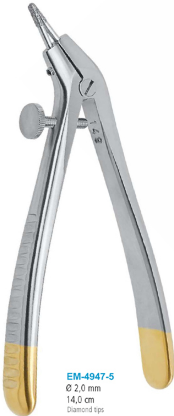
EM-4947-5 Ø 2,0 mm 14,0 cm Diamond tips