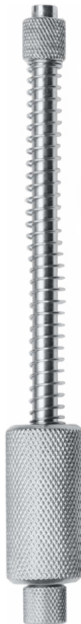
EM-4925-10 MORELL with tips 4924-1, 4924-2 and 4924-3