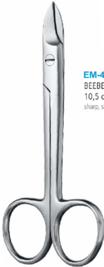
EM-4821 BEEBEE 10,5 cm sharp, straight