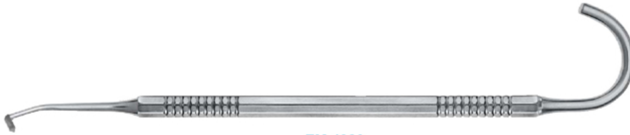
EM-4920 TREYMANN 16,0 cm Shepherd's crook