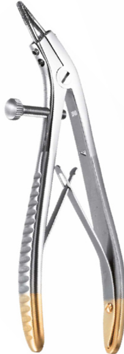
EM-4947-4 Ø 2,35 mm 12,5 cm Diamond tips